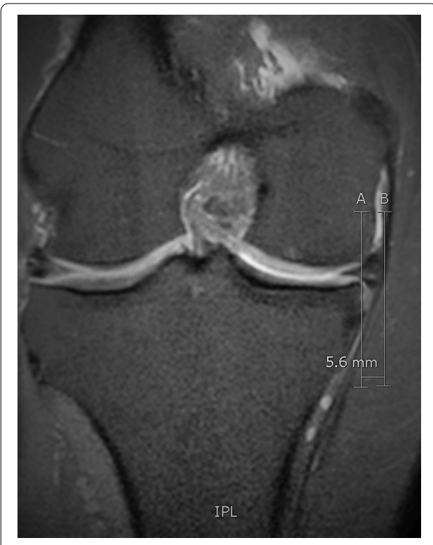
Fig. 1 Magnetic resonance imaging (MRI) mid-coronal view of the right knee, where the tibial eminences are most prominent. Medial meniscal extrusion (MME) is measured 5.6 mm

The term meniscal extrusion (ME) is used to describe the radial meniscal body displacement beyond the peripheral tibial plateau margin [7, 8]. A threshold of 3 mm, which was initially introduced, is most commonly used to define a significant ME [8]. Nevertheless, there is still controversy in the literature regarding the optimal threshold, as a few studies have proposed a value lower than 3 mm [9, 10], whereas other researchers suggest that a cutoff value higher than 3 mm is optimal [11-13]. Moreover, instead of a single value, Miller et al. defined significant ME as when more than 25% of the meniscal body width extends beyond the tibial limit [14–17]. Magnetic resonance imaging (MRI) is the method of choice for the detection and evaluation of ME (Fig. 1), although it may underestimate ME, as the assessment is routinely not performed under weight-bearing conditions [18-20]. Therefore, ultrasound (U/S) was recently introduced as a reliable alternative to MRI for the evaluation of ME, which also offers the possibility for dynamically assessing ME in various positions, as well as in a weight-bearing state, in an inexpensive and feasible manner [20-22]. Interest in ME has grown exponentially in